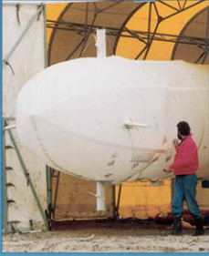
Illustration of the Cargo Airship System; Nord-Am engineers with prototype; Dallas Headquarters; 1984 Canada Award for Invention Excellence; Prototype flight trials; Magnus-sphere prototype; Texas A&M windtunnel with cargo airship model; Artist concept of 1200' Cargo Airship; L.E.A.P. Drone; L.E.A.P. prototype & hanger; Envelope testing at Gatineau, Quebec.